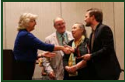
Congratulations to FUMC Huntsville for receiving the Methodist Retirement Communities Impact Award at Annual Conference!