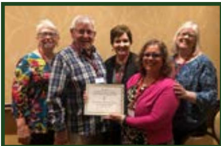
Congratulations to Millican UMC for receiving the Small Church Award from the West District at Annual Conference!