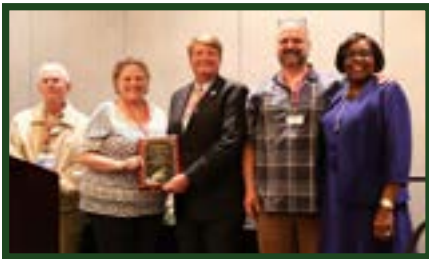
Congratulations to FUMC Brenham for receiving the 500 Average Attendance Worship Service award at Annual Conference!